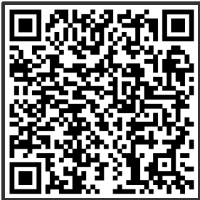
Listen to the Dialogue