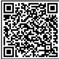
All Learning Content Related to this Topic

Solutions: Good morning, I don't think we have met. / Good morning. No, we haven't. My name is David Brown. / Pleased to meet you, Mr. Brown. My name is Hazel Scott. / How do you do, Mrs. Scott? / I'm doing quite well. How about yourself? / Good as well. What company are you working for? / I'm with Ferox, a computer company based in Chicago. / Have you met Mr. Gray from Compex? He specializes in computer engineering. / No, not yet. / Let me introduce you. I think you would be interested in learning about his business. / Sounds good.