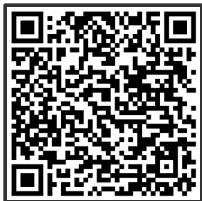
Listen to the Dialogue